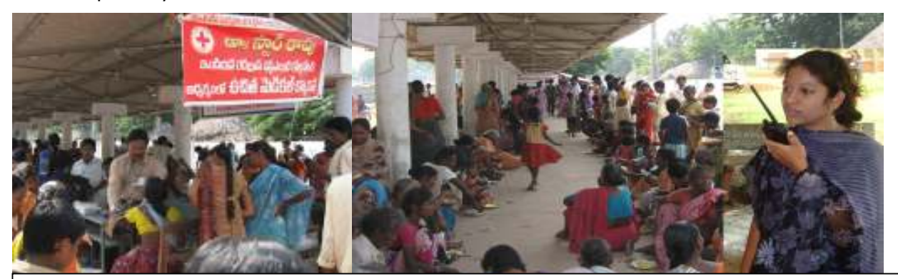
VU2YAM from a free medical camp organized by an NGO at the rehabilitation centre

Avanigadda before the rail/road communication between Hyderabad and Vijayawada was temporarily cut off.